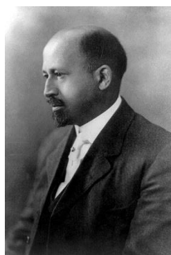
W. E. B. Du Bois