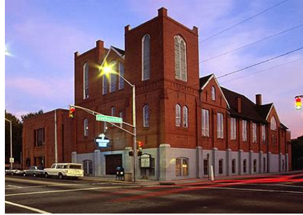
Ebenezer Baptist Church