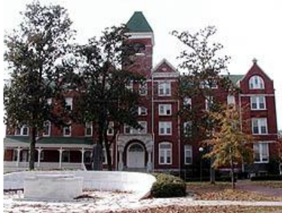
Graves Hall, Morehouse College

Field trips will take you to Piedmont Park where Booker T. Washington delivered his “Atlanta Compromise” address and to Atlanta University where W. E. B. Du Bois penned The Souls of Black Folk . Workshop scholars will lead you in the footsteps of Dr. King as he played in his childhood home, attended Morehouse College, pastored Ebenezer Baptist Church, and now is buried on Auburn Avenue with his wife Coretta.