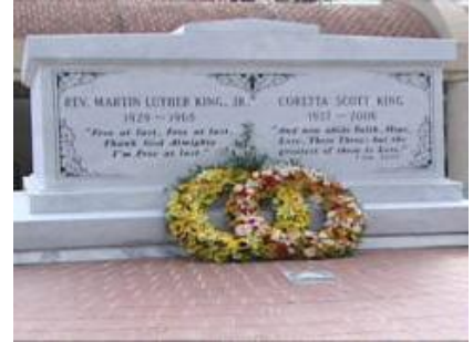
M. L. and Coretta King Tomb

The historic landmarks that you will visit reveal the history of a segregated society and the struggle to dismantle it. The gold-domed Capitol building is where Jim Crow laws were passed and where African Americans protested their passage. The Fox Theater bears the imprint of the color line, with separate entrances, seating, and rest rooms for black and white theater goers. The downtown Rich’s Department Store and City Hall are facilities, once segregated, which still carry the imprints of their civil rights battles. The roots of resistance to the color line began on Auburn Avenue, the historic heart of the African American business, civic, and religious communities, and on the Atlanta University Center campuses where students organized sit-ins and demonstrations in the 1960s. Atlanta has memorialized these events at the sites where civil rights history was made. Summer Scholars can bring these on site experiences to their classrooms.